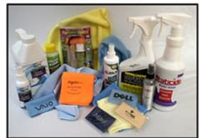
Professional & Eco Friendly Screen Care Products