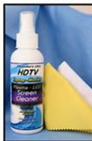
Photodon Ultra Screen Cleaning Kit #4501