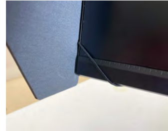
Image 5 The elastic cord should hold the hood tightly against the monitor