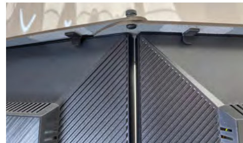
Image 3 Support bracket placement example

The black support brackets will keep the top of the hood from sliding backward. The brackets have an interlocking adhesive strip, which will attach to the interlocking strip on the hood's bottom (gray) side that overhangs the back of the monitors. The hood can be tilted slightly up or down to give it the desired look. With the hood held in place at the desired position, attach one bracket along each of the strips (C) on the hood by firmly pressing the interlocking side of the bracket into the strip. The brackets should be placed with the short side of the "L" shape pressed against the back of the monitor. If necessary, the brackets can be removed or repositioned by carefully pulling the bracket off while holding the strip on the hood. ( Image 3 )