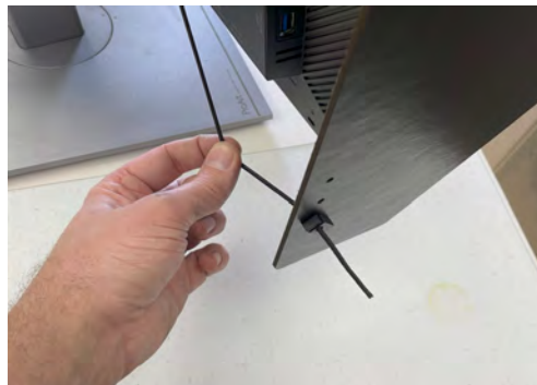
Image 2 Grasp the cord near the bottom corner of the monitor

Grasp the elastic cord near the bottom of the legs and pull it around the bottom outside corners of the monitors, as shown in Images 2-5 . Adjust the angle of the hood and tighten the two dotted thumbscrews on top. If the cord slips from the corner, you can rethread the cord through different sidewall holes so that the angle of the cord across the front of the monitor properly supports the hood as shown in Image 5 . It may also be necessary to adjust the tightness of the cord to keep it securely wrapped around the corners of the monitors.