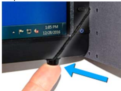
Image 2 Round button and cord placement

Tighten the mount by pulling the slack in the elastic cord through the cord locks on both sides. You may need to slide the cord from the backside to get the tension that is best for your monitor. The cord should be fairly tight. It is possible that you may need to change the holes that the cord is using to improve the mount for your monitor.