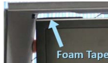
Image 4 Foam Tape Placement

If needed, use the foam strip to block any light gaps. With the hood in place, mark