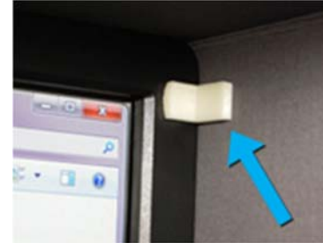
Image 3 Support bracket placement, actual brackets are black.

The black support brackets will keep the top of the hood from sliding backwards. The hood can be tilted slightly up or down to give it the desired look you like. Look at it from all angles. Remove the red tape from a support bracket to reveal the adhesive. Place the bracket to the top inside corner of the hood , tight against the monitor ( Image 3 ). Press firmly to adhere. Repeat on the other side. If removal of the bracket is necessary, gently twist and pull.