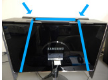
Image 1 Back of Monitor – Ensure elastic cord (highlighted in blue) is looped around the top knobs.

Place the hood on the monitor with the elastic cords behind the monitor.