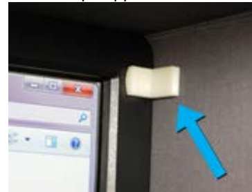
Image 5 Support bracket placement, actual brackets are black.

The black support brackets will keep the top of the hood from sliding backwards. The hood can be tilted slightly up or down to give it the desired look you like. Look at it from all angles. Remove the red tape from a support bracket to reveal the adhesive. Place the bracket to the top inside corner of the hood, tight against the monitor (image 5). Press firmly to adhere. Repeat on the other side. If removal of the bracket is necessary, gently twist and pull.