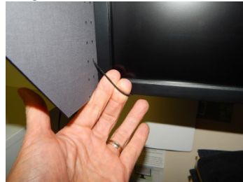
Image 3 Front of Monitor

Standing in front of the monitor, pull one side out (image 2) and loop the elastic cord around the corner of the monitor as shown (highlighted in image 3). Repeat for the opposite side.