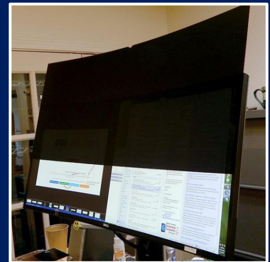
Privacy filter for a curved monitor

We worked with our contact at the FBI to get measurements of the various monitors. Paper templates were sent to ensure a proper fit prior to full production. Bulk discounted, perfectly fitted filters were sent within 3 weeks of the purchase order submission. Total number of filters: 450 (ranging from 24-30 inches).